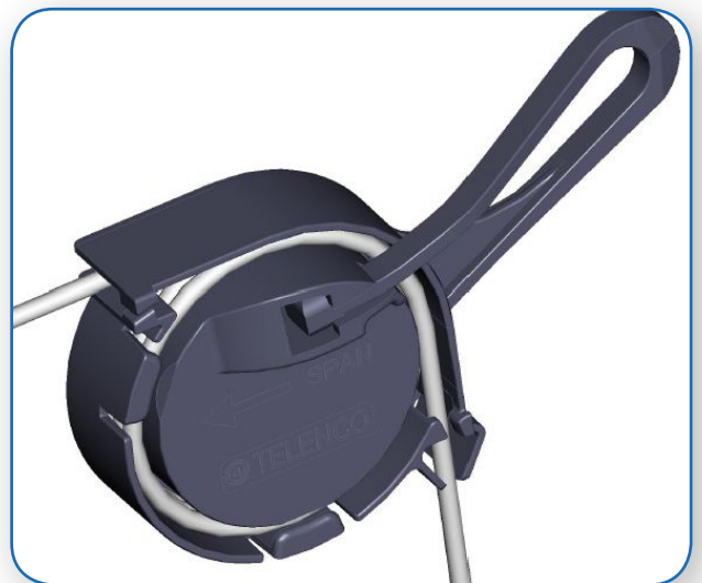
Cable installed (3 rolls) Bail locked