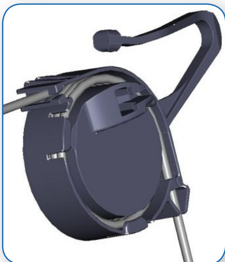
Cable installed (3 rolls) Bail not locked